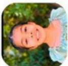
Dahlia 11 July 3rd