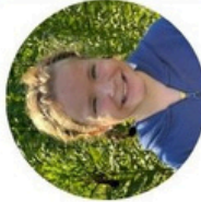
Raygen | 11 October 24th